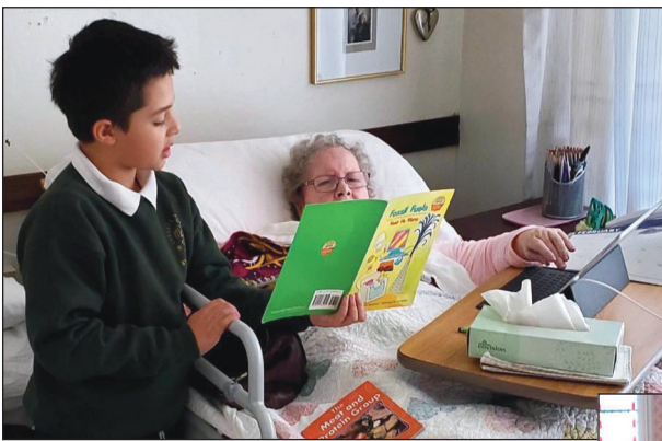
St. Peter's 3rd graders practiced reading aloud during their visit to a local nursing home!