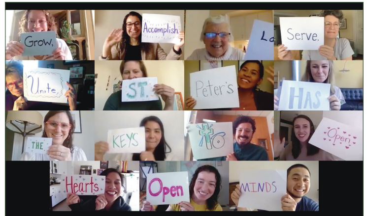
Faculty staying focus on what matter’s most – the St. Peter’s School mission.

“El esfuerzo de todos por mantenernos seguros, en contacto y ante todo la educación de nuestros hijos para que no pierdan de estudiar. Gracias a todos.” (We appreciate) everyone’s effort to keep us safe, in touch and above all, continue the education of our children so that they do not stop learning. Thank you all.