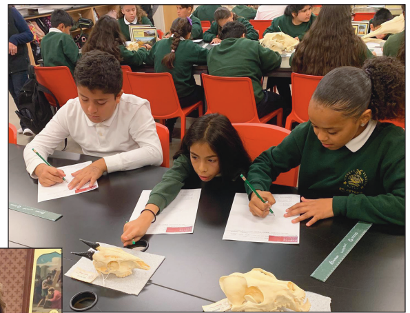
Fifth graders enjoyed their annual school day at California Academy of Sciences.