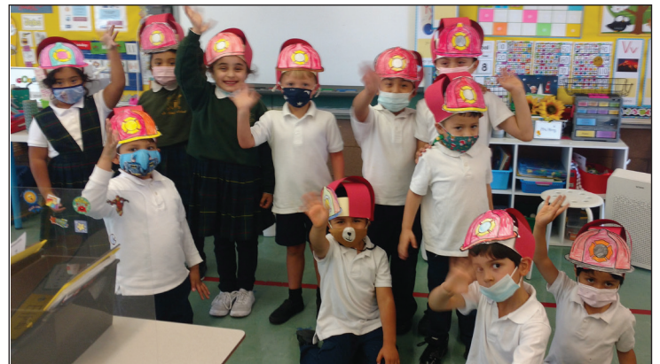
Future fire fighters!

Perhaps there was a fire fighter in your family or another person you would like to honor with a gift . A plaque will list names of those who donate $250 or more.