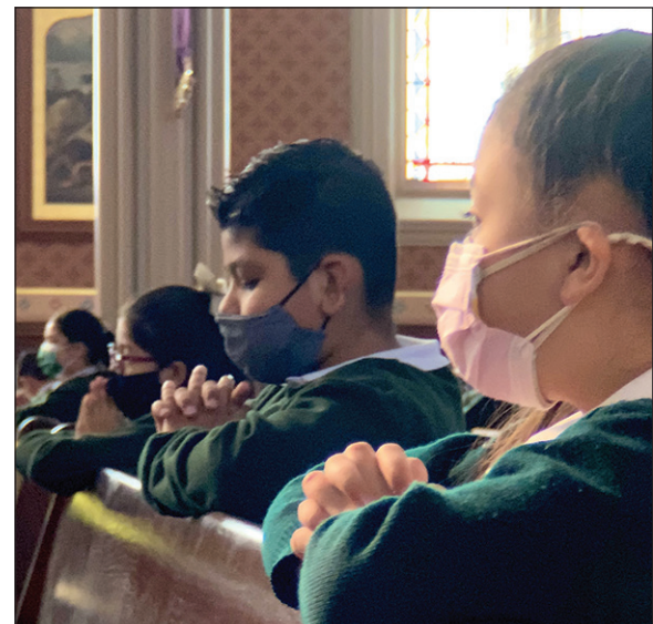
Families are welcome to join students during weekly School Mass.