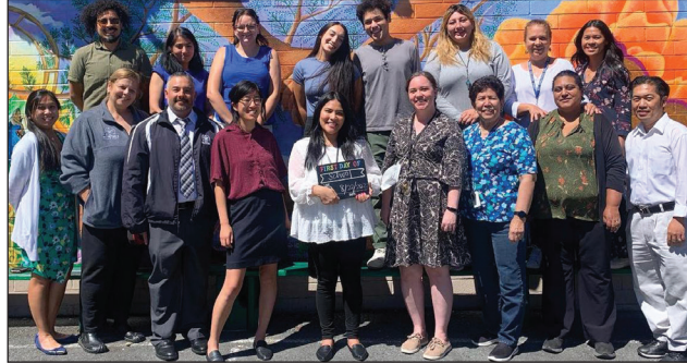
The St. Peter's team

This year, St. Peter's School celebrates 144 years of education and service! After enduring the COVID difficulties of the past two years, our faculty, staff, and families enter this new school year with a greater sense of joy and gratitude as we have more opportunities for celebrating and reconnecting with each other.