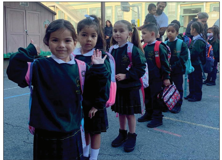
Parents can once again come on campus for morning assembly.