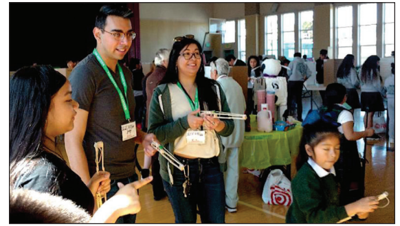
UCSF Volunteers at 2019 STEAM Fair