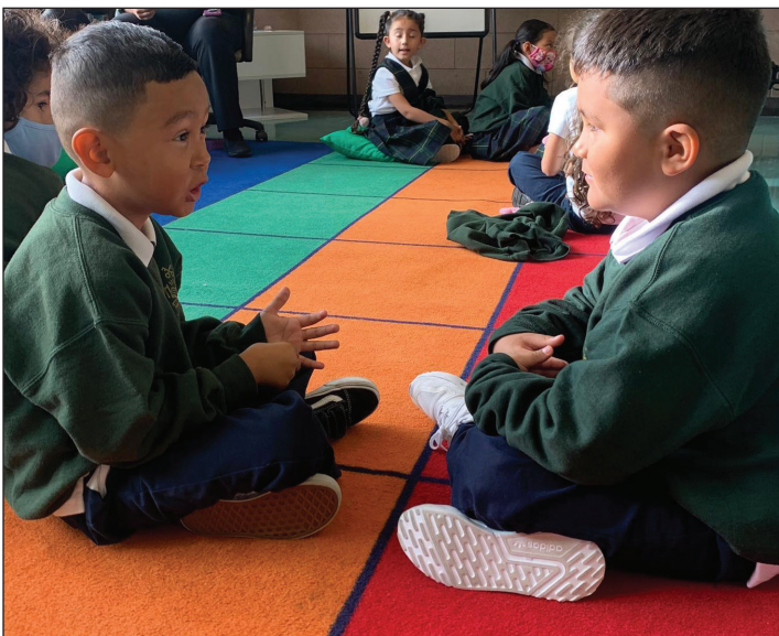
Getting to know new classmates in 1st grade.